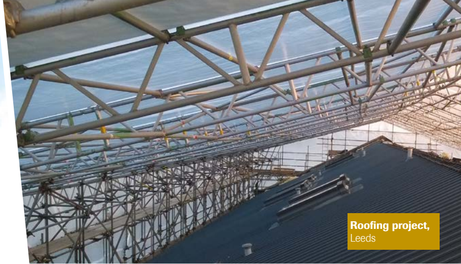
Roofing project, Leeds