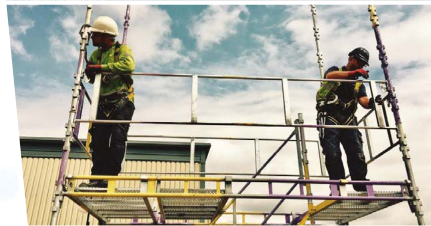
Temporary footbridge, Riddlesden