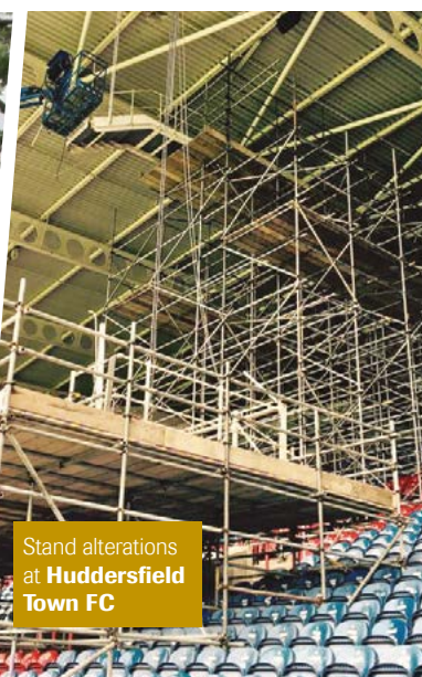
Stand alterations at Huddersfield Town FC